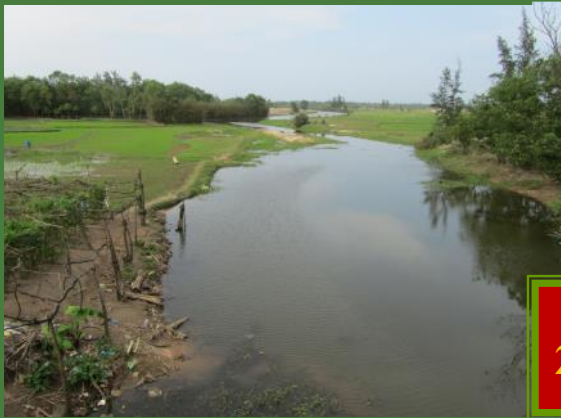
Left & Above Left: North of the Cuu Viet where Rusty Cascio’s MedEvac picked up 8 WIAs out of a hot LZ! Above Right: Happy Hour in Hanoi!

28 APR TUE - (Day 14) After breakfast, we depart Hanoi (cross international dateline) arrive in Los Angeles or your hometown same day.